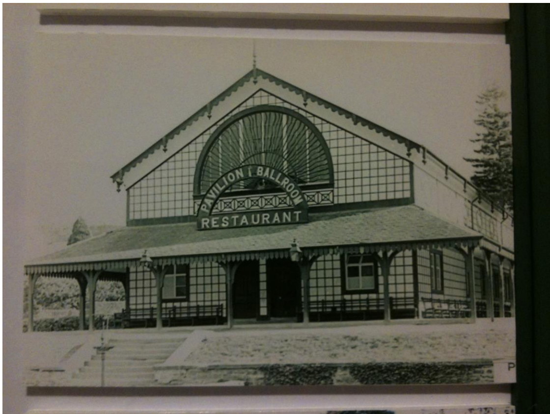
exterior, early 1900's