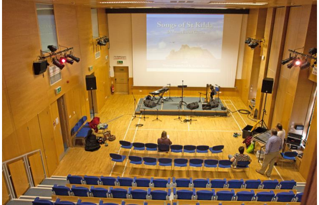
Flexible stage area