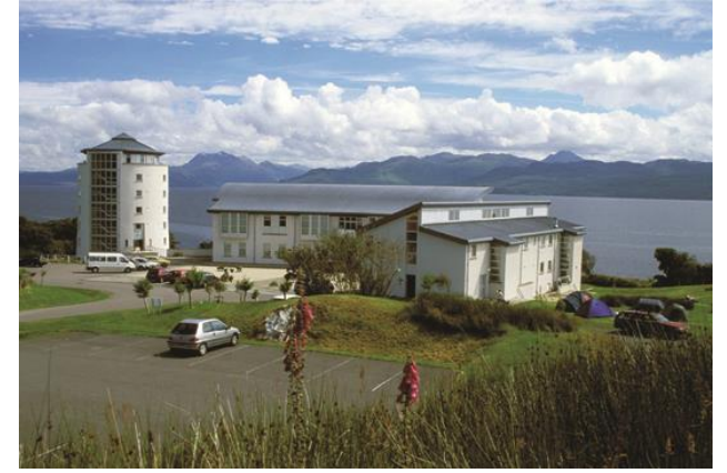
Venue in the middle building with accommodation either side