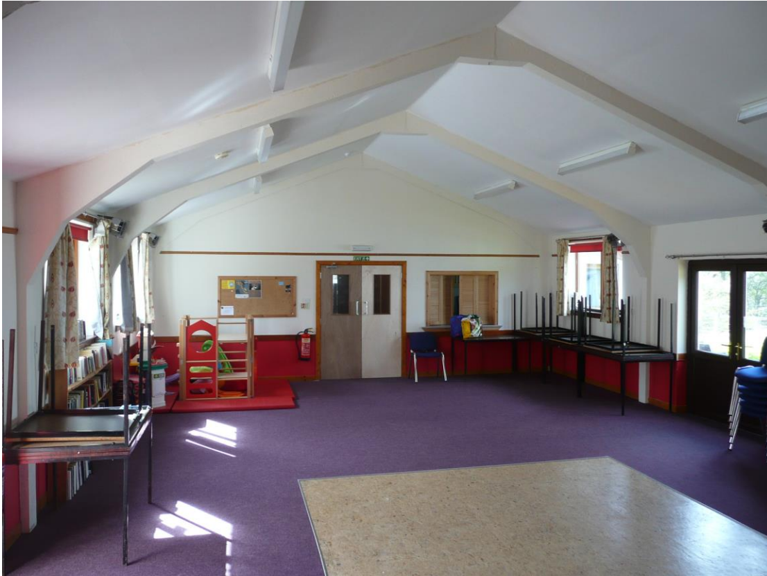
SLEAT COMMUNITY HALL, ARDVASAR, ISLE OF SKYE totally renovated late 1991